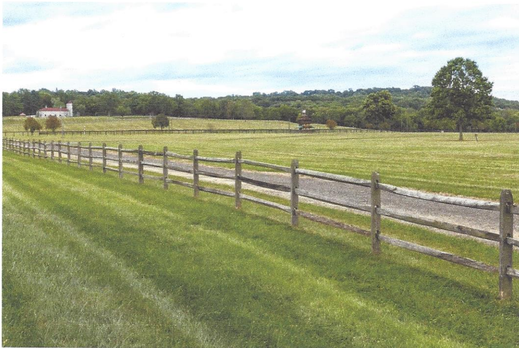
Moorland Farm on Route 202 in Far Hills will host the Mars Essex Horse Trials, a top equestrian competition, from June 24-25.

park and get right up to the rails and rope lines to see the horses in action during all three equestrian events.